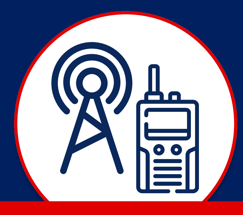
ESF 2 COMMUNICATIONS