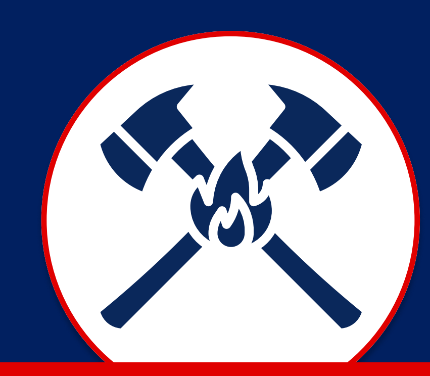
ESF 4 FIREFIGHTING