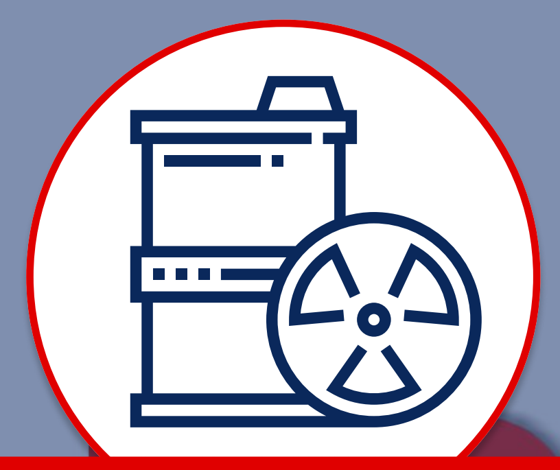
ESF 10 HAZARDOUS MATERIALS & ENVIRONMENTAL PROTECTION