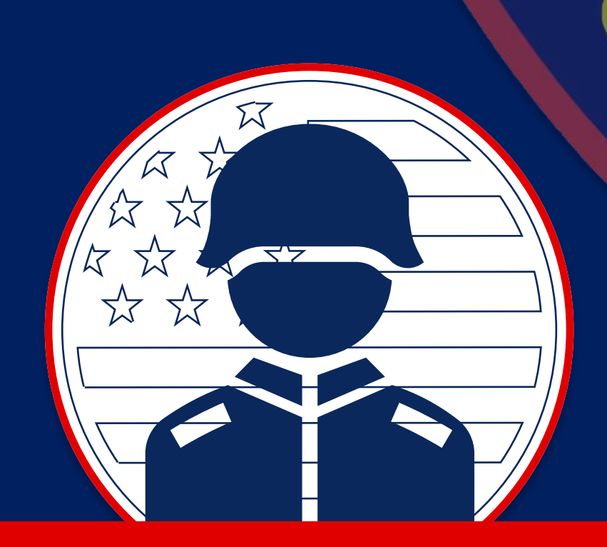
ESF 13 MILITARY SUPPORT