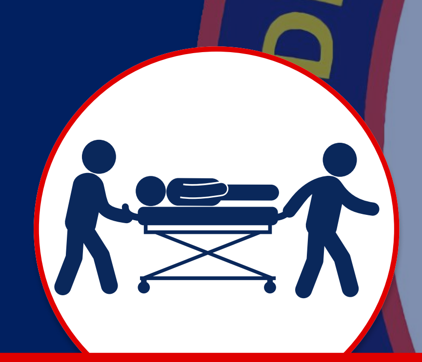
ESF 9 SEARCH & RESCUE